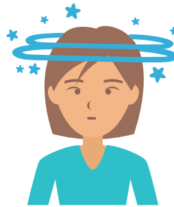
Lack of Coordination